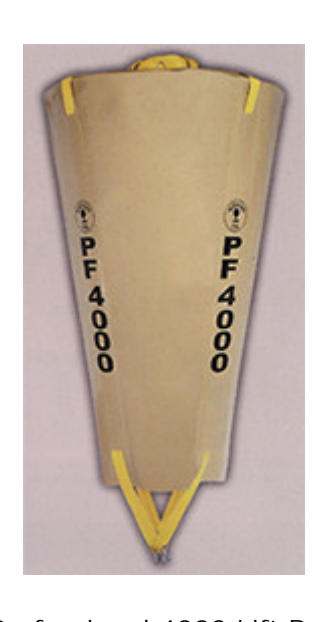
Professional 4000 Lift Bag