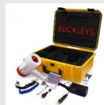
BathyCorrometer® Pro 6004-0078