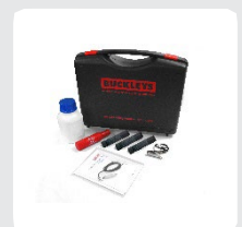
BathyCorrometer® Calibration Kit 6004-0031