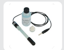
Glass K-Series Reference Cell 6004-0013