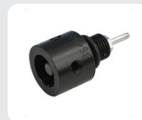
Silver/Silver Chloride Half Cell 6004-0051