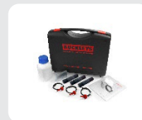
Calibration Kit 6004-0032